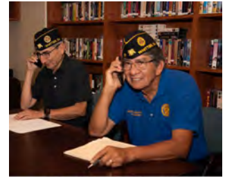
The American Legion BUDDY CHECK Program

The Buddy Check program is rapidly becoming one of The American Legion's most important programs. Originally this was a "comradeship campaign" for members and former members of the organization. It has proven effective to keep veterans up to date on important issues facing them. As these Buddy Checks continue, our callers are asked to be alert to signs of depression and suicide so veterans can learn about the critical resources available to improve their mental well-being. It's quite possible the information provided could ease burdens face by veterans or maybe even save a life.