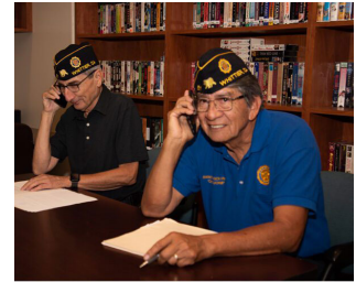
The American Legion BUDDY CHECK Program

The Buddy Check program is rapidly becoming one of The American Legion's most important programs. Originally this was a "comradeship campaign" for members and former members of the organization. It has proven effective to keep veterans up to date on important issues facing them. As these Buddy Checks continue, our callers are asked to be alert to signs of depression and suicide so veterans can learn about the critical resources available to improve their mental well-being. It's quite possible the information provided could ease burdens face by veterans or maybe even save a life.